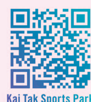
Kai Tak Sports Park