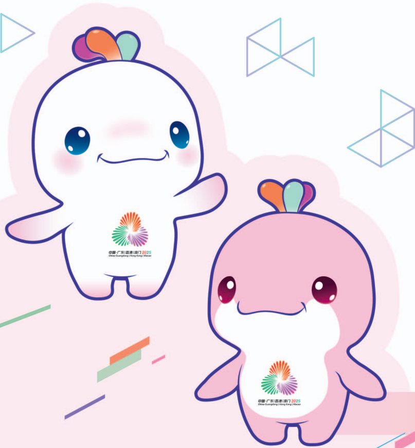
Inspired by the Chinese white dolphin, the mascots Xiyangyang (left) and Lerongrong (right) symbolise joy, harmony and unity.

A series of blockbuster events has already been lined up for Kai Tak Sports Park, among them are the World Grand Prix (snooker) and Hong Kong Sevens (rugby) in March, British rock band Coldplay's world tour in April. Following the highly anticipated concerts of Asian popstars Nicholas Tse and Jay Chou at the stadium in April and June, there will be three of the eight competition events and one mass participation event held in Hong Kong as part of the 15 th National Games in November.