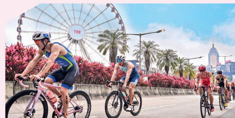
The triathlon event will be staged in Hong Kong. The test event was successfully held at the Central Harbourfront and Victoria Harbour earlier.

advantages for developing itself into a platform for international sports activities. The Government of the Hong Kong Special Administrative Region will continue to foster sports development by maintaining Hong Kong as a centre for major international sports events and developing sports as an industry.