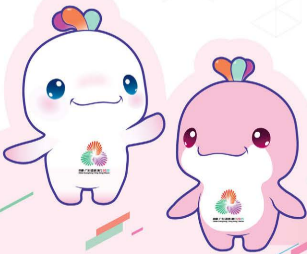
Inspired by the Chinese white dolphin, the mascots Xiyangyang (left) and Lerongrong (right) symbolise joy, harmony and unity.

A series of blockbuster events has already been lined up for Kai Tak Sports Park, among them are the World Grand Prix (snooker) and Hong Kong Sevens (rugby) in March, British rock band Coldplay's world tour in April. Following the highly anticipated concerts of Asian popstars Nicholas Tse and Jay Chou at the stadium in April and June, there will be three of the eight competition events and one mass participation event held in Hong Kong as part of the 15 th National Games in November.