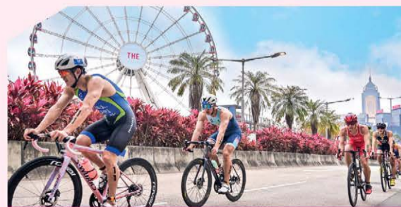
The triathlon event will be staged in Hong Kong. The test event was successfully held at the Central Harbourfront and Victoria Harbour earlier.

advantages for developing itself into a platform for international sports activities. The Government of the Hong Kong Special Administrative Region will continue to foster sports development by maintaining Hong Kong as a centre for major international sports events and developing sports as an industry.