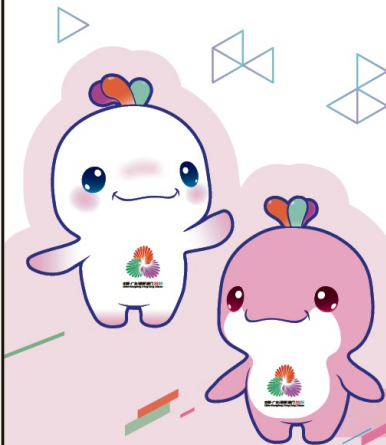
Inspired by the Chinese white dolphin, the mascots Xiyangyang (left) and Lerongrong (right) symbolise joy, harmony and unity.

A series of blockbuster events has already been lined up for Kai Tak Sports Park, among them are the World Grand Prix (snooker) and Hong Kong Sevens (rugby) in March, British rock band Coldplay's world tour in April. Following the highly anticipated concerts of Asian popstars Nicholas Tse and Jay Chou at the stadium in April and June, there will be three of the eight competition events and one mass participation event held in Hong Kong as part of the 15 th National Games in November.