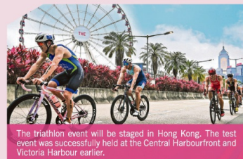
The triathlon event will be staged in Hong Kong. The test event was successfully held at the Central Harbourfront and Victoria Harbour earlier.

unrivaled advantages for developing itself into a platform for international sports activities. The Government of the Hong Kong Special Administrative Region will continue to foster sports development by maintaining Hong Kong as a centre for major international sports events and developing sports as an industry.